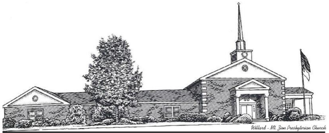
Willard - Mt. Zion Presbyterian Church