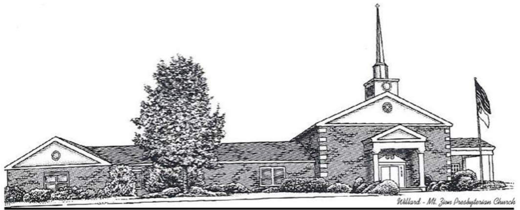
Willard - Mt. Zion Presbyterian Church

It is the mission of Willard-Mt. Zion Presbyterian Church to serve God, to reach out in love and care for our congregation, our community and the world; to be people who are Christ centered, fed by God's word and led by the Holy Spirit. COME HOME TO CHURCH.