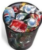
Aluminum cans for the Boy Scouts