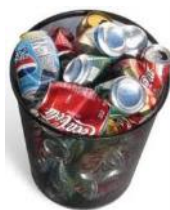
Aluminum cans for the Boy Scouts