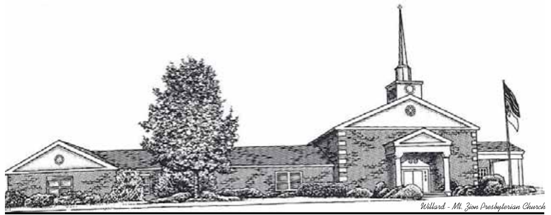
Willard - Mt. Zion Presbyterian Church